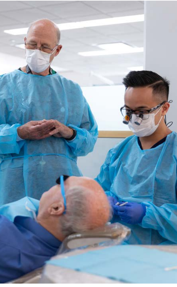
We harness advanced technologies to provide the highest quality of patient care and most up-to-date treatments available.