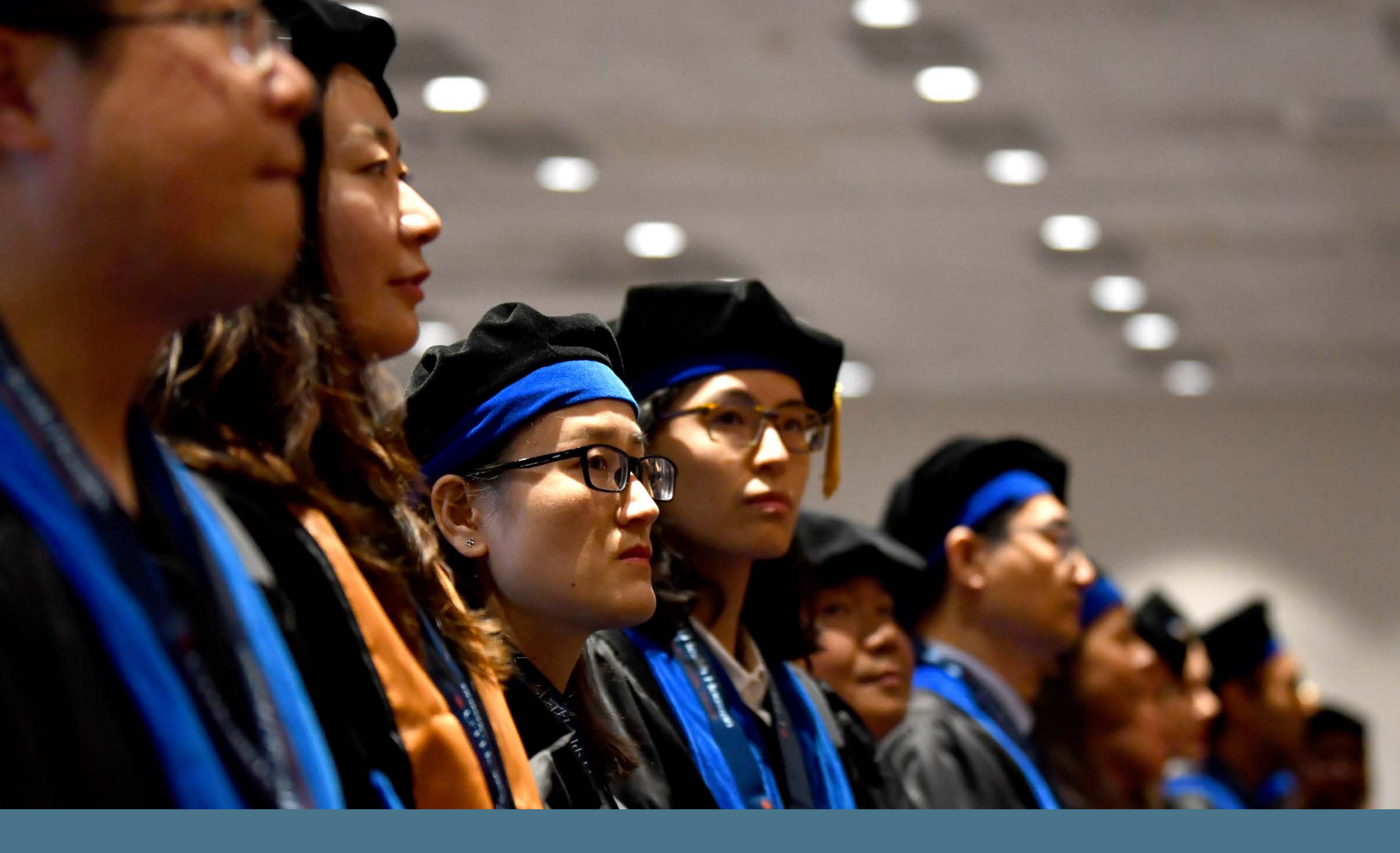
UTHealth Houston educates more than 5,000 health care professionals each year.