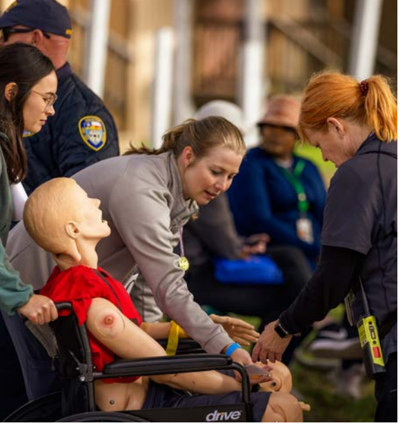
At UTHealth Houston, training is interactive, collaborative and hands-on.