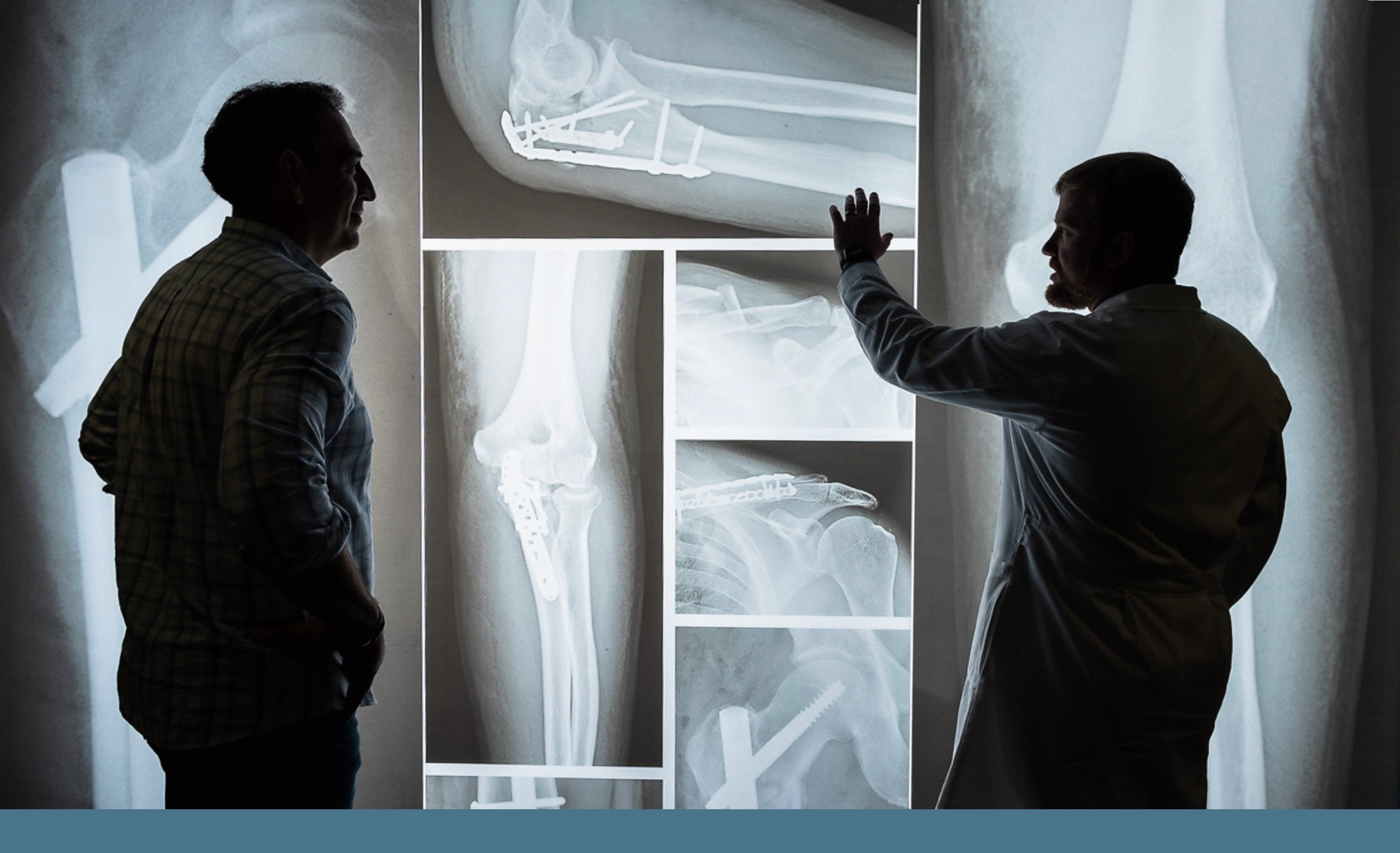
At UTHealth Houston, advancing life and delivering exceptional care is at the heart of our mission, transforming challenges into triumphs for our patients.